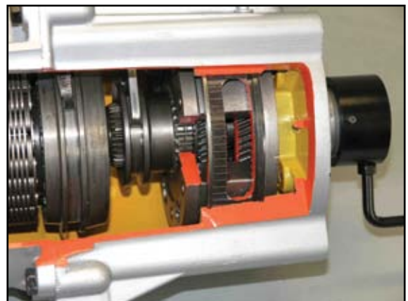
Transfer Case (High Range Position) Close-Up (model 1230)

Call Now to Place your Order (Press 2 for Sales)