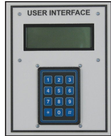
Student Response and Local Fault Insertion Panel