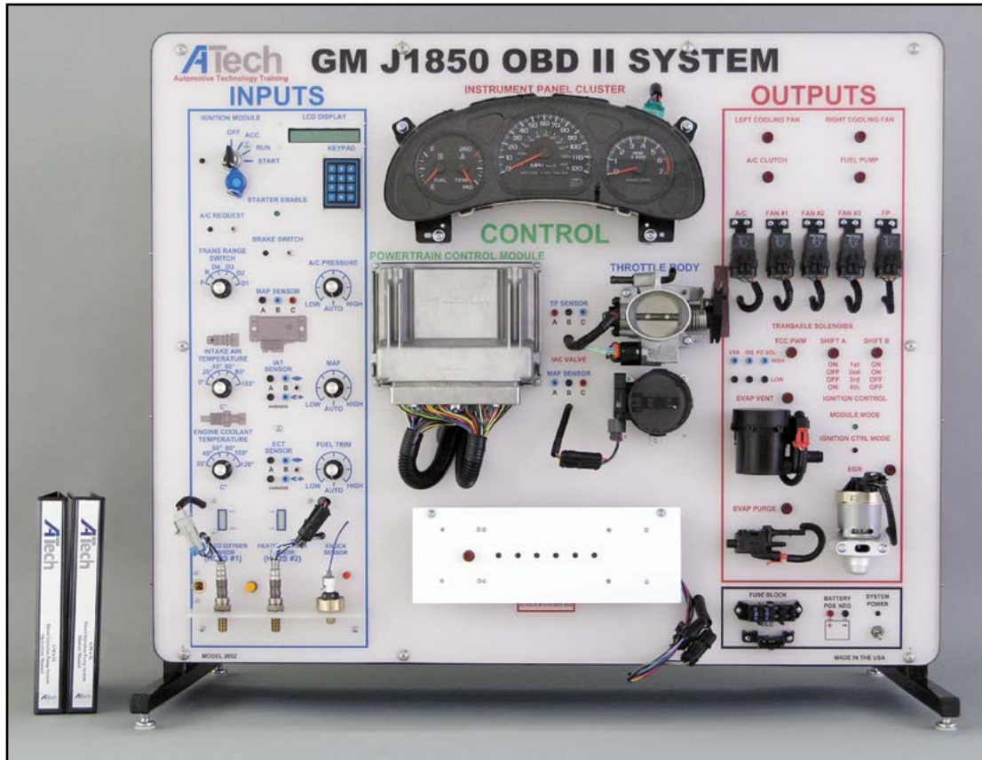
GM J1850 OBD II System (Dry) - model 2652 DRY